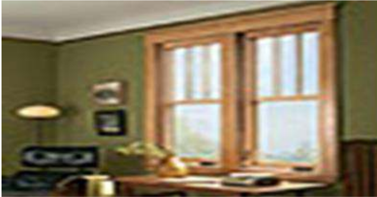
V810 used in windows and doors